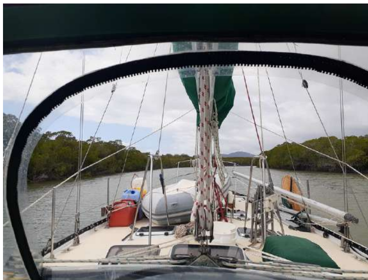
View of fore deck as we head up a river north of Cairns.

I've added a few photos of Opportunity here for your interest and give you a visual of our home for nine months of the year. We are currently in the yard at Hastings doing some much needed maintenance after 6 years of hard sailing and are preparing her for the next planned cruise to Tasmania and South Australia followed by a possible Pacific adventure.