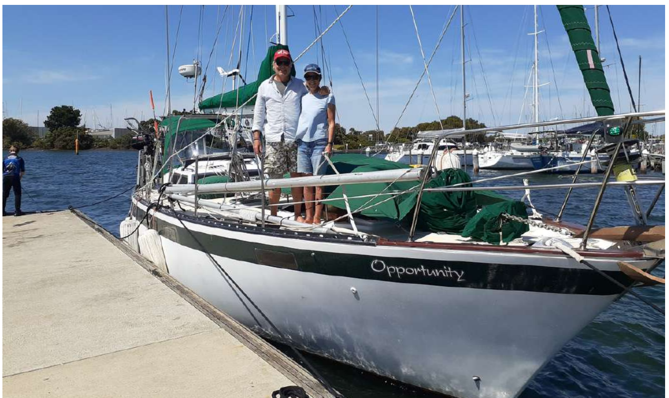
Safe return to Hastings after 6 years of cruising.

We had been looking for our 'perfect' cruising yacht [everything is a compromise in my view] for sometime and stumbled upon Opportunity on Yachthub. She had just completed a 2 year cruise from Canada down the East Coast of America, through the Panama Canal and across the Pacific. Once here the owner packed up, put her on the Market and flew home to Canada, lucky for us he put a very affordable price on the boat so we called the broker, jumped on a plane to Brisbane and the rest is history.