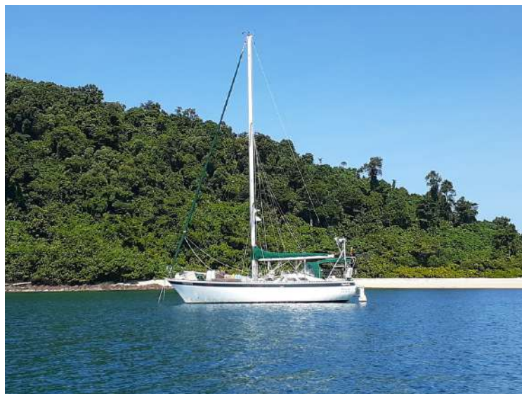
Opportunity at Kent Island Northern Qld

In our next article we will outline the many things we feel are important to have onboard if you are planning an extended cruise along with the things we learnt along the way which served us well.