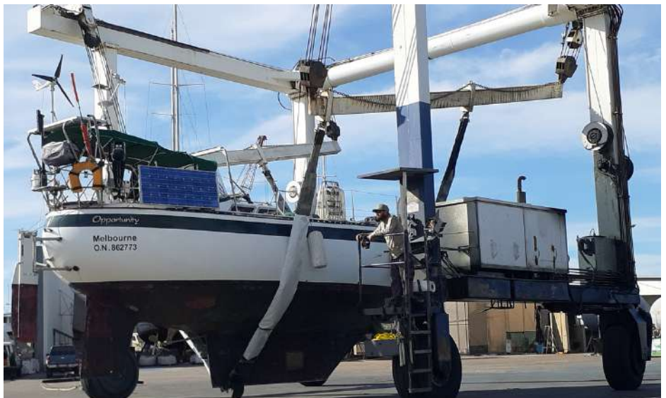
Shows the keel and rudder structure.

Having found the boat we felt would serve us well and completing the upgrades required, within budget, we then set about preparing and planning our first big cruise. We had a rough idea of where we were heading but being retired and having no time restraints we were prepared to work with nature and explore as much as we could of Tasmania and the East Coast before heading off further afield.